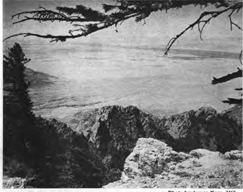
A VAST EXPANSE OF NEW MEXICO greets the eye when you reach the top of the Sandia Mountains. This view south shows the mountains behind Socorro, about 75 miles south of Albuquerque. On the clearest days it is possible to see over 150 miles up and down the Rio Grande Valley.

One of the easiest, and perhaps the most spectacular drives in New Mexico, is only a short distance outside the city of Albuquerque. This is the Skyline Drive, commonly known as "the trip to the rrest," It takes you atop the Sandia Mountains 10,678 feet above sea level, where you may see 150 miles up and down the Rio Grande valley.